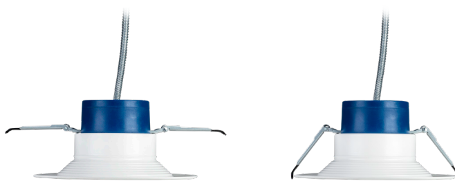
Equipped with mounting clips for easy installation

Visit creelighting.com or contact a Cree Lighting representative to learn more.