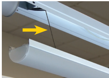
Suspension cable allows lens to hang hands-free during wiring