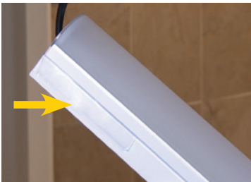
Pull tabs for easy lens removal