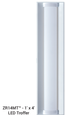
ZR14MT™ - 1' x 4' LED Troffer