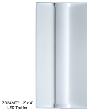
ZR24MT™ - 2' x 4' LED Troffer